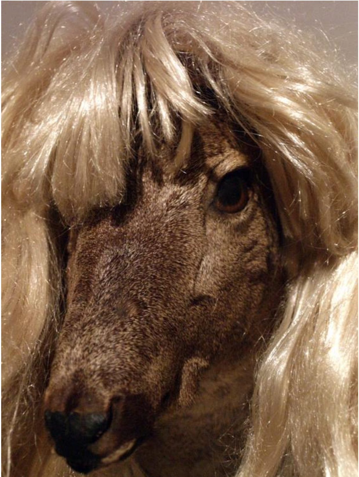
Veado, assemblage, animal's head in taxidermy, wig

+49.(0)30.31809794 factory-art.com info@factory-art.com