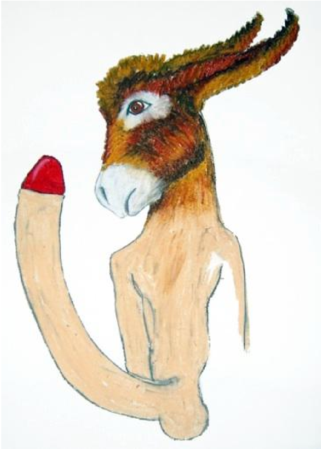
Ass, 2008, pencil and pastel on paper, cm 30x20

+49.(0)30.31809794 factory-art.com info@factory-art.com