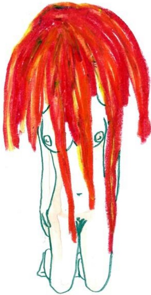
Chiara, pencil and pastel on paper, cm 30x20

+49.(0)30.31809794 factory-art.com info@factory-art.com