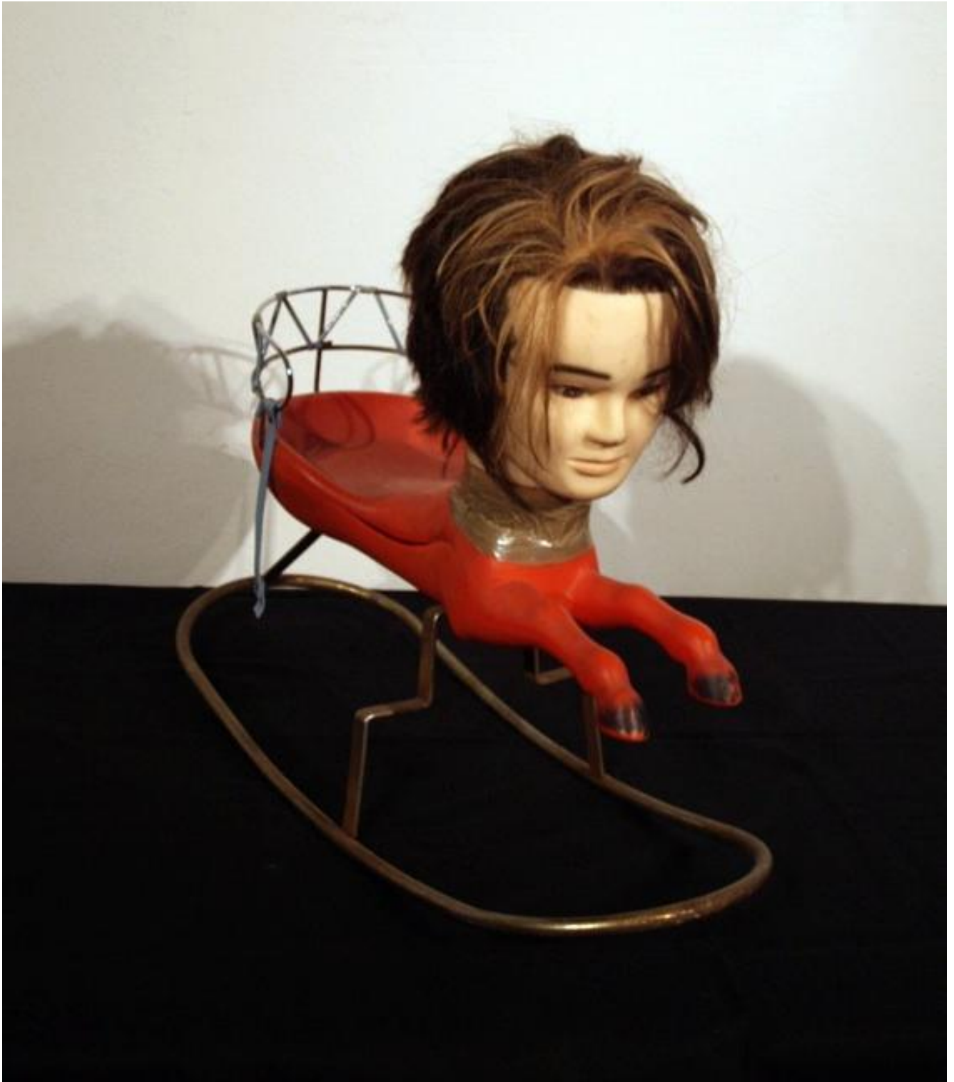
Lento / Slow, assemblage, rocking horse and plastic head with real hairs

+49.(0)30.31809794 factory-art.com info@factory-art.com