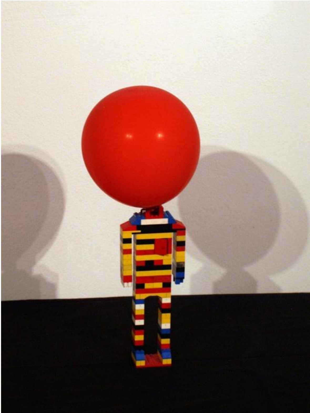
Pierpaolo, assemblage, Lego briks, balloon in Murano glass

+49.(0)30.31809794 factory-art.com info@factory-art.com