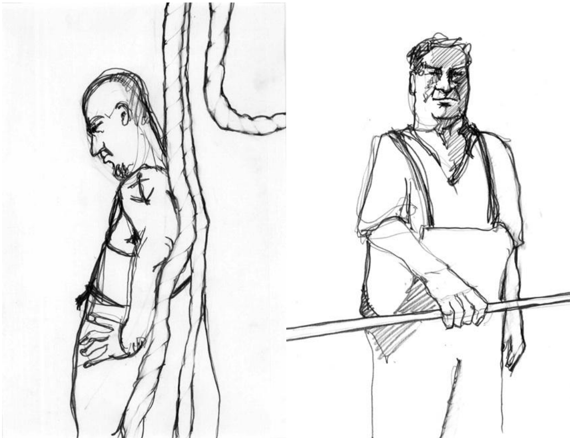
drawings, pencil on paper, cm 20x30