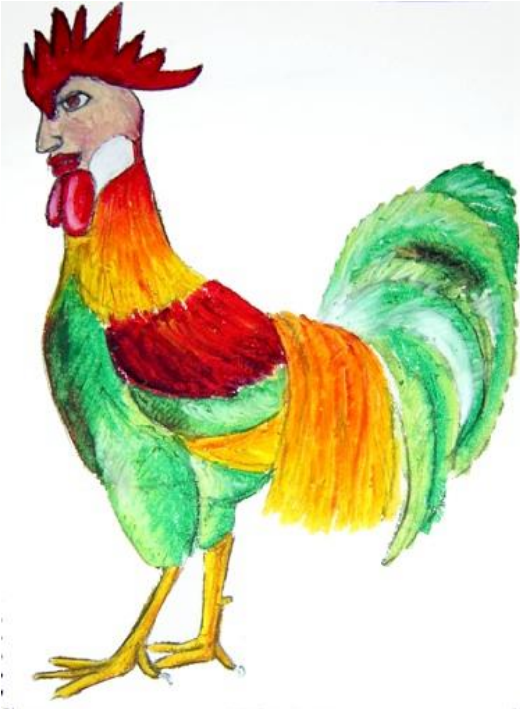
Green cock, pencil and pastel on paper, cm 30x20

+49.(0)30.31809794 factory-art.com info@factory-art.com