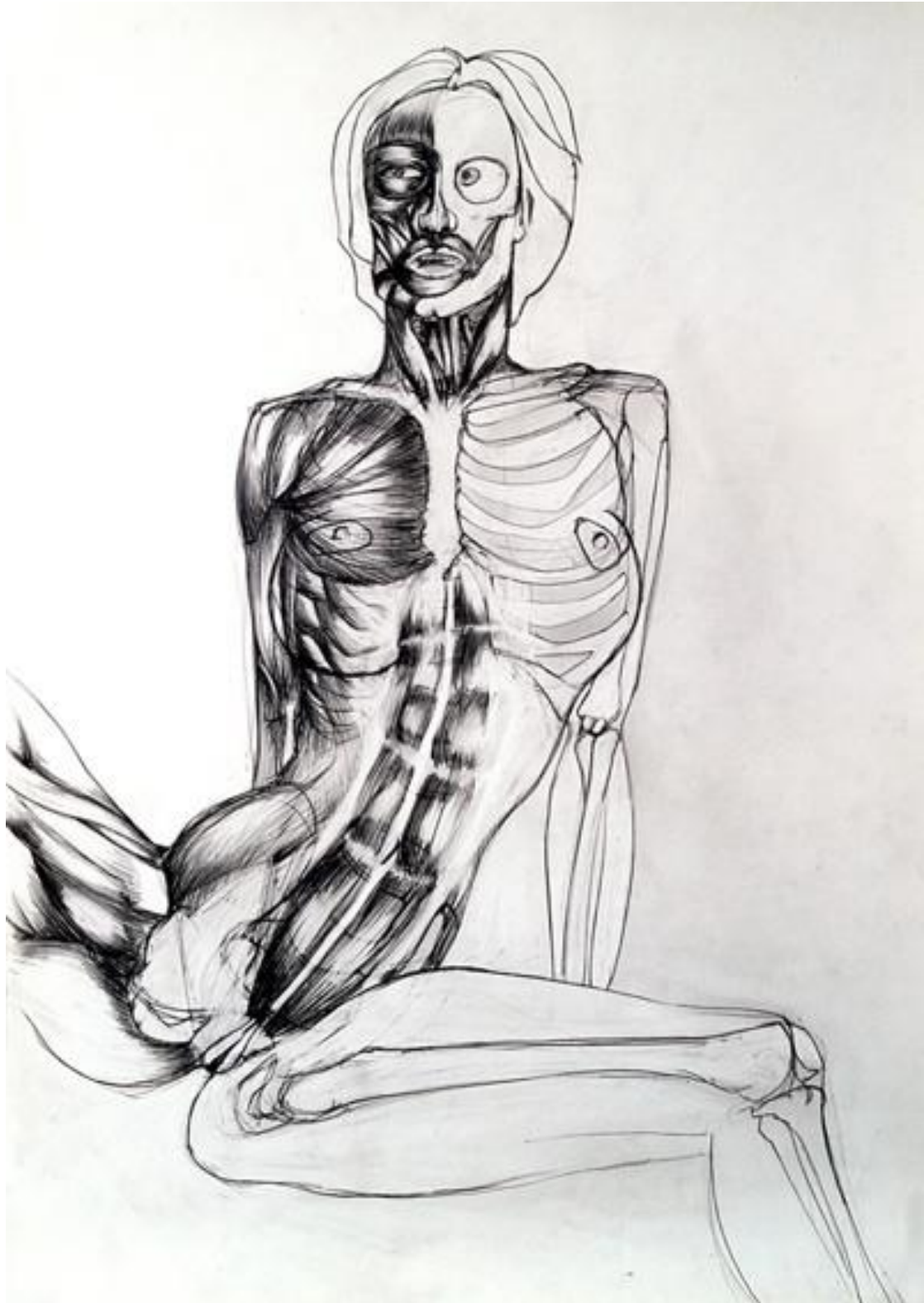
Anatomy, pencil on paper, cm 150x100

+49.(0)30.31809794 factory-art.com info@factory-art.com