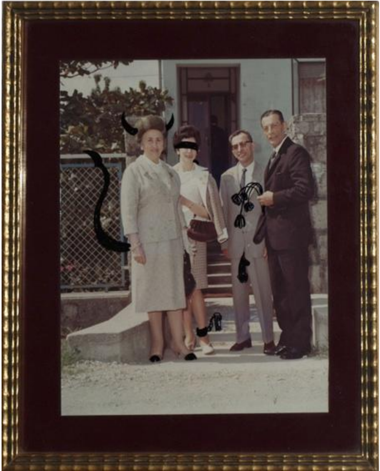
Famiglia Cristiana / Christian Family, marker on photography

+49.(0)30.31809794 factory-art.com info@factory-art.com