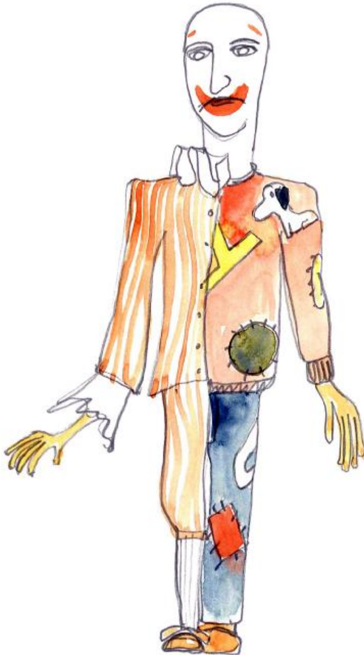
The fighter clown, pencil and water-colors on paper, cm 30x20

+49.(0)30.31809794 factory-art.com info@factory-art.com