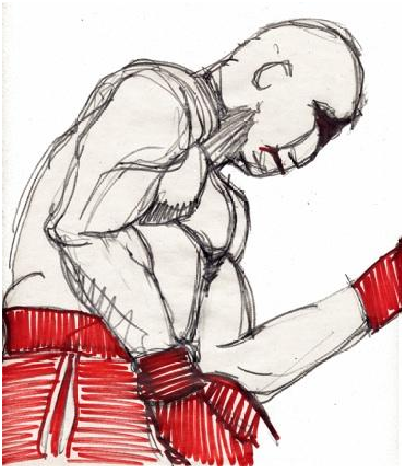
George Foreman, 2002 pencil and red marker on paper, cm 30x20

+49.(0)30.31809794 factory-art.com info@factory-art.com