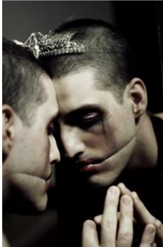
La più bella del reame, 2009

Every fairy tale is different, every character has his own feature, behind every detail our real US is hiding. Looking at pictures the ending is ambiguous and is impossible to understand how it's going to end. Everything is in the protagonist hands, it's just him that can decide for himself, just him will know if he will have the strength to change his ending or not.