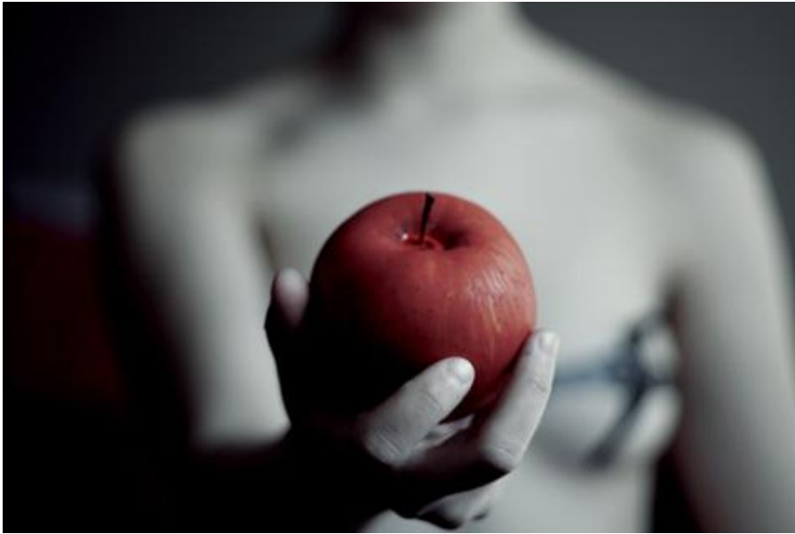
Il Cuore di Biancaneve , 2009 inkjet print 70 x 50 cm