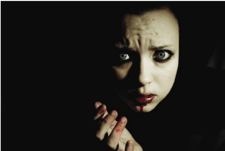
Ingannevole - il cuore piu' di ogni cosa, 2007 inkjet print 50 x 70 cm