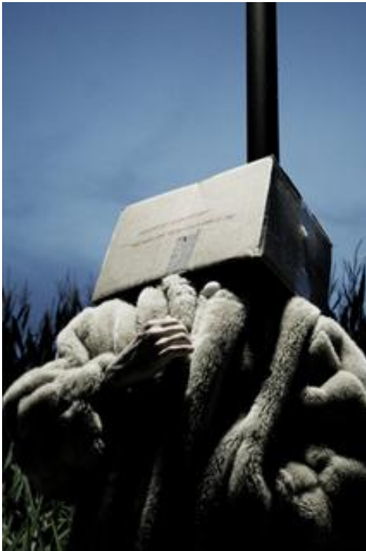
Miss elegance , 2008 inkjet print 70 x 50 cm

It's a progressive drift that focuses on what we'd like to look. Forgets how we are under a thin film of standardization. Despite that, feeling the real essence of ourselves, recognizing the very truth of things, is still possible.