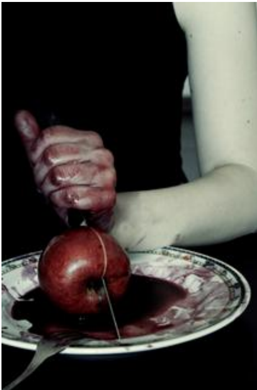
Il Cuore di Biancaneve , 2009 inkjet print 70 x 50 cm -

My fairy tales are told by photography. They play with old stories, hiding what we can find about them in everyday life. Character's stories can be interpreted every time in a different way, what changes the perception of the image are our feelings and our experiences.