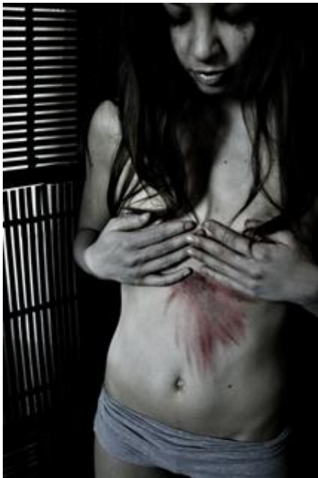
With my heart, 2008

+49.(0)30.31809794 factory-art.com info@factory-art.com