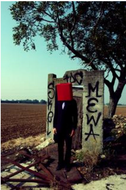
Metropol , 2007