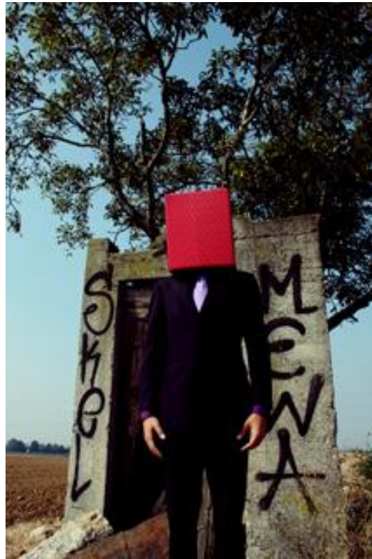
Metropolitan man , 2007 inkjet print 70 x 50 cm