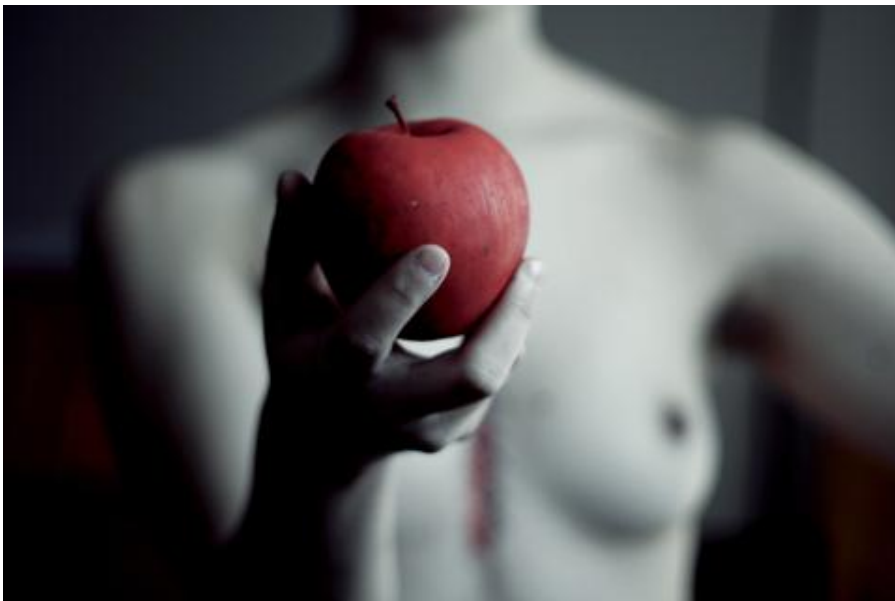
Il Cuore di Biancaneve , 2009 inkjet print 70 x 50 cm