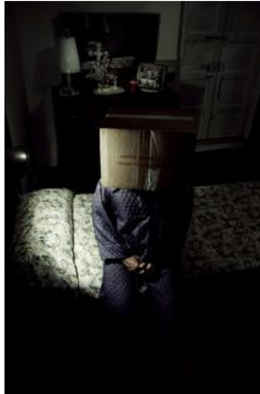
Ignorance , 2008 inkjet print 70 x 50 cm

My "Postcards from Nowhere" represent what is hidden, that reality that is hidden behind the stereotyped image of what we fake to be.: if eyes and mind could decide to ignore something, reality become the indicator of the hidden essence.