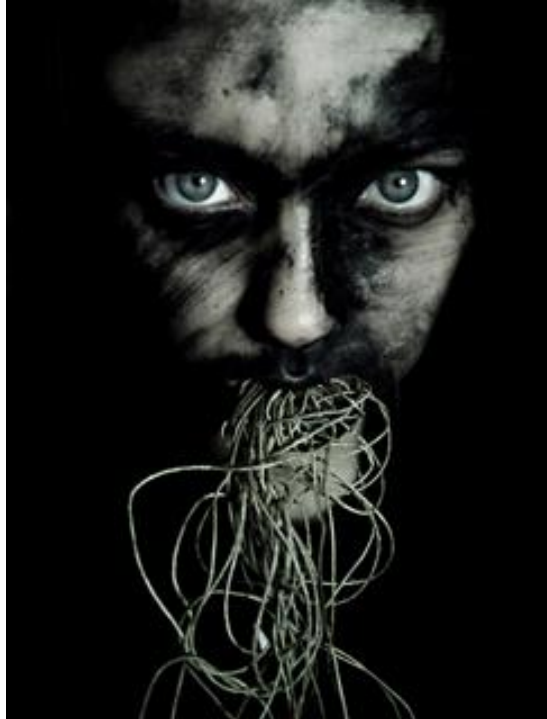
Vomiting my own soul, 2008