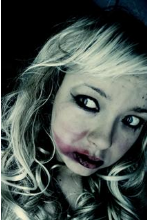
For the money, 2007 inkjet print 70 x 50 cm

+49.(0)30.31809794 factory-art.com info@factory-art.com